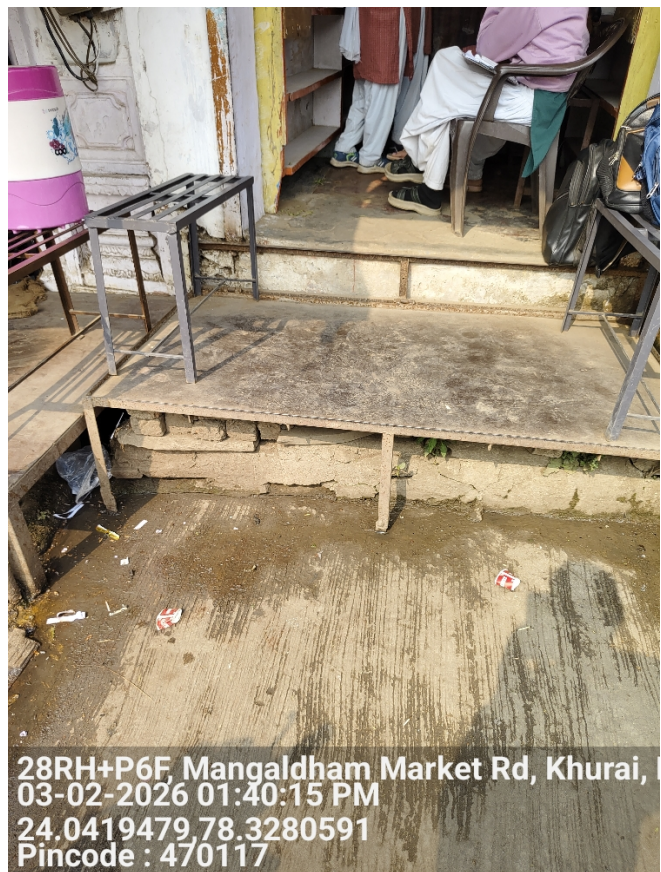
Photo of Machinery Setup