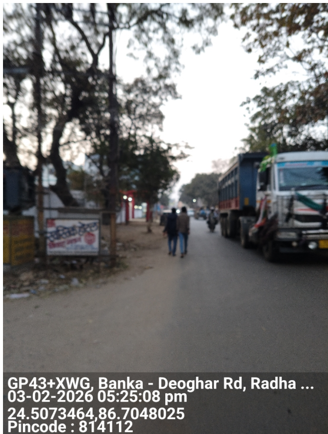
GP43+XWG, Banka - Deoghar Rd, Radha ... 03-02-2026 05:25:08 pm 24.5073464,86.7048025 Pincode : 814112

Take Photo of QR Code/Soundbox/EDC Machine