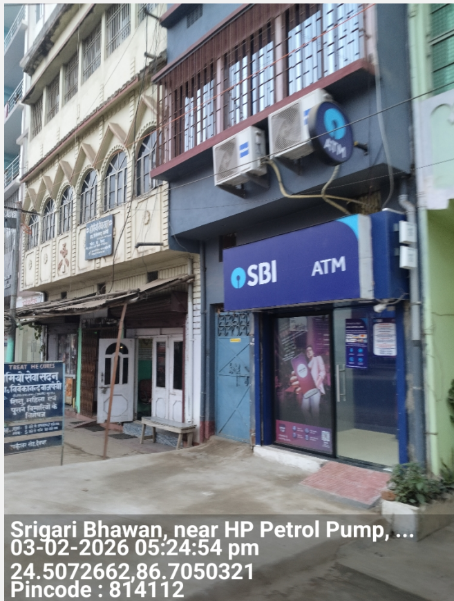
Srigari Bhawan, near HP Petrol Pump, ... 03-02-2026 05:24:54 pm 24.5072662,86.7050321 Pincode : 814112

Take Photo of Person Met Inside the Shop