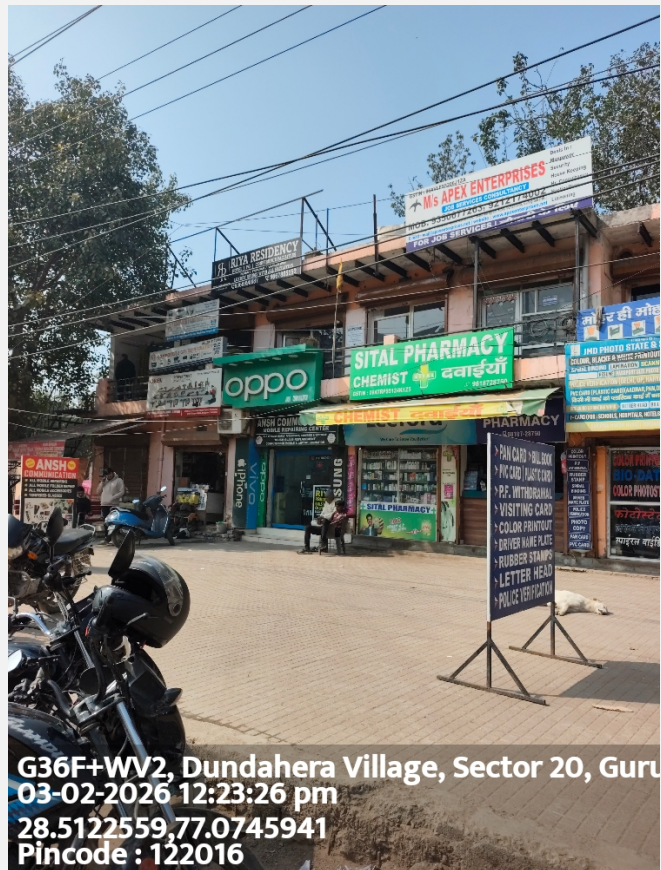
G36F+WV2, Dundahera Village, Sector 20, Gurugram 03-02-2026 12:23:26 pm 28.5122559,77.0745941 Pincode : 122016

Shop front with horizontal view covering the left & right of the shop establishing if the shop is an individual structure, in a marketplace, highway, isolated place, in a cluster framework.