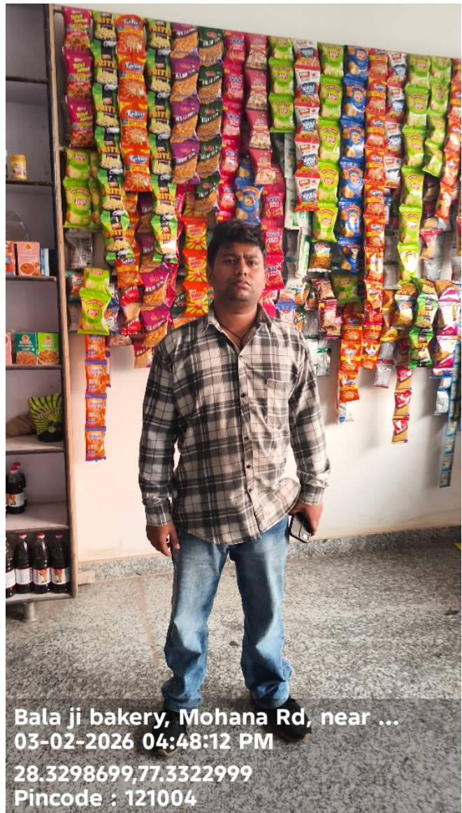
Bala ji bakery, Mohana Rd, near ... 03-02-2026 04:48:12 PM 28.3298699,77.3322999 Pincode : 121004

Take Photo of Person Met Inside the Shop