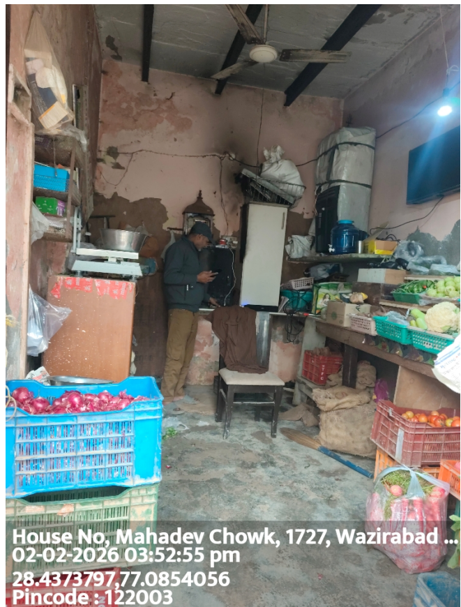
House No, Mahadev Chowk, 1727, Wazirabad ... 02-02-2026 03:52:55 pm 28.4373797,77.0854056 Pincode : 122003

Shop inside with inventory photos establishing that the inside is of the same shop where the front photo was taken