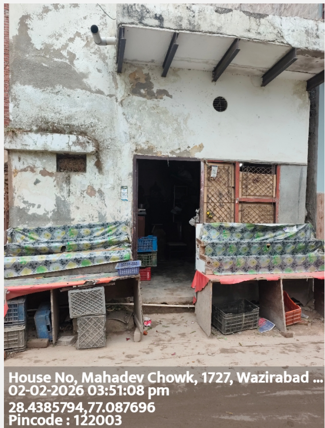
House No, Mahadev Chowk, 1727, Wazirabad ... 02-02-2026 03:51:08 pm 28.4385794,77.087696 Pincode : 122003

Shop front with horizontal view covering the left & right of the shop establishing if the shop is an individual structure, in a marketplace, highway, isolated place, in a cluster framework.