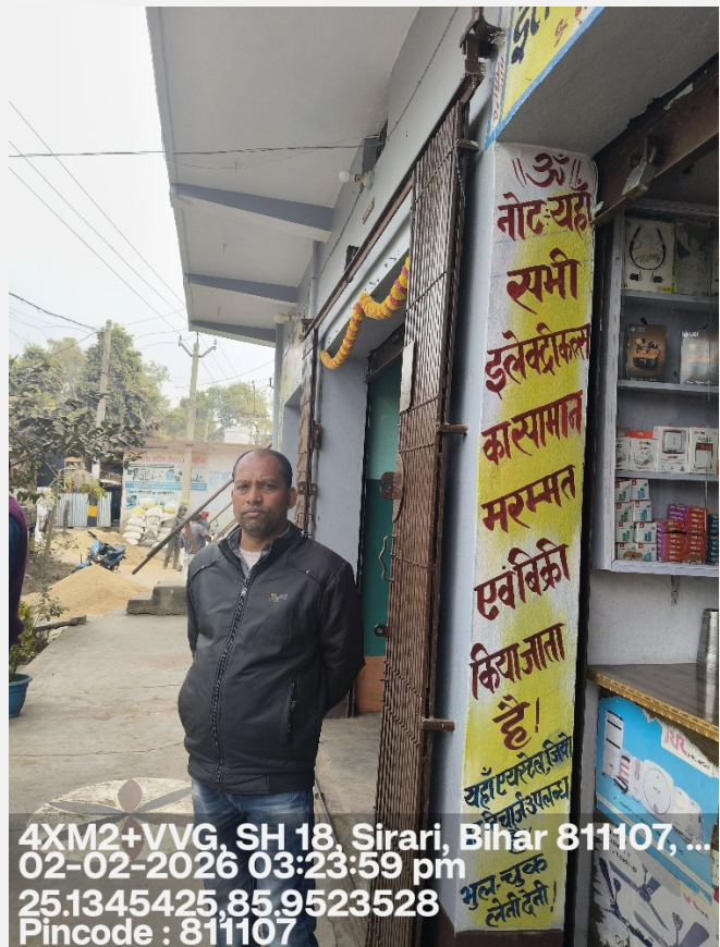
Shop Photo Outside