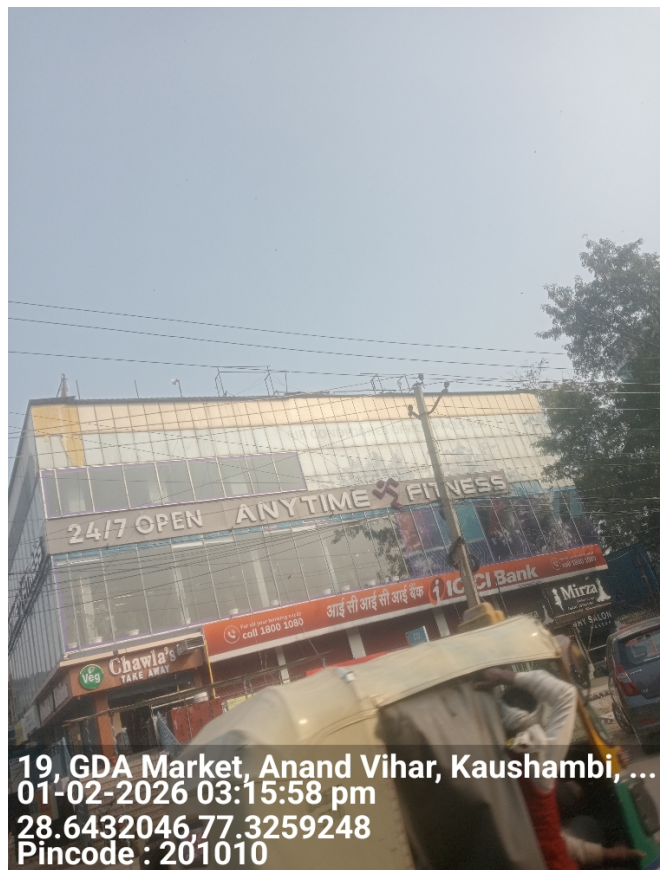
19, GDA Market, Anand Vihar, Kaushambi, ... 01-02-2026 03:15:58 pm 28.6432046,77.3259248 Pincode : 201010

Shop front with horizontal view covering the left & right of the shop establishing if the shop is an individual structure, in a marketplace, highway, isolated place, in a cluster framework.