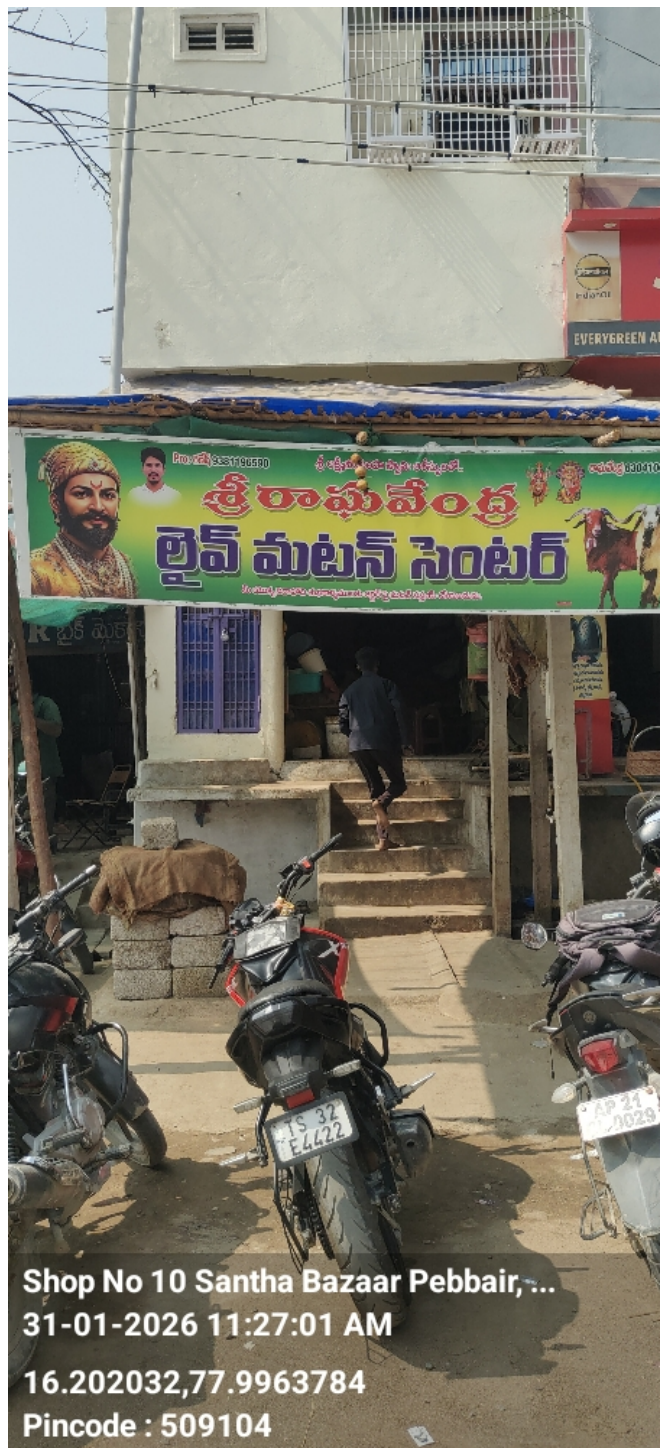
Shop No 10 Santha Bazaar Pebbair, ... 31-01-2026 11:27:01 AM 16.202032,77.9963784 Pincode : 509104

Shop front with horizontal view covering the left & right of the shop establishing if the shop is an individual structure, in a marketplace, highway, isolated place, in a cluster framework.