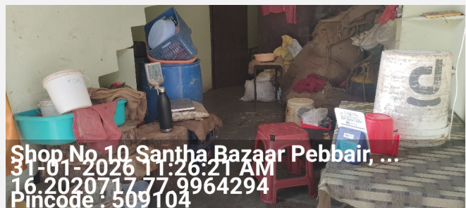
Shop No 10 Santha Bazaar Pebbair, ... 31-01-2026 11:26:21 AM 16.2020717,77.9964294 Pincode : 509104

Shop inside with inventory photos establishing that the inside is of the same shop where the front photo was taken