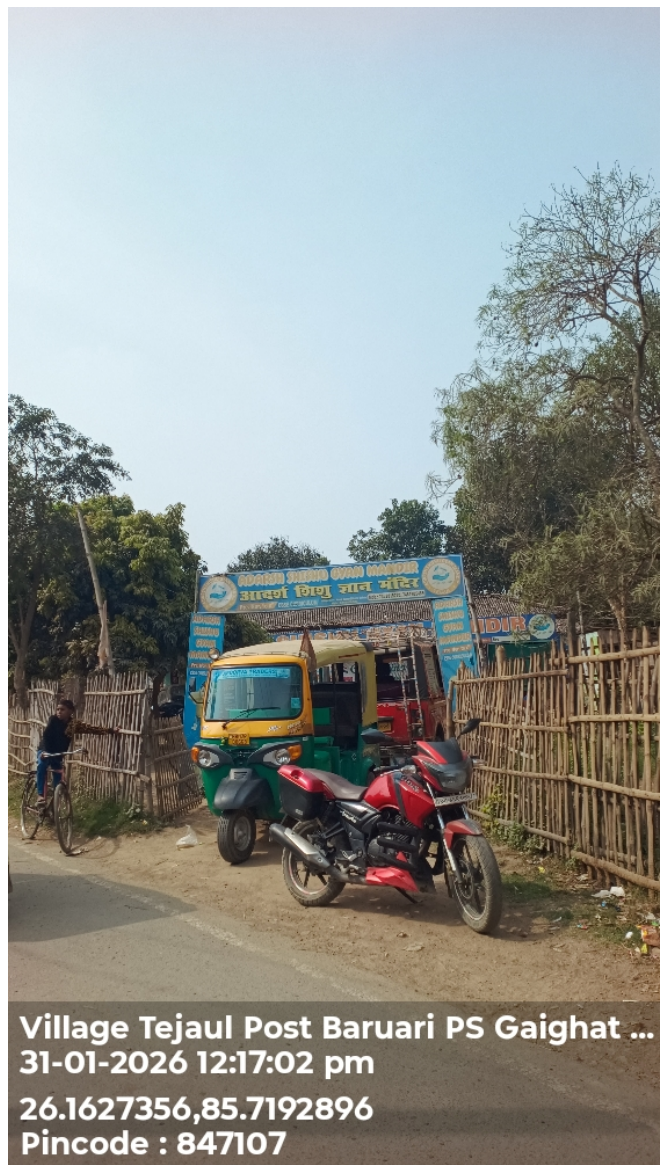
Village Tejaul Post Baruari PS Gaighat ... 31-01-2026 12:17:02 pm 26.1627356,85.7192896 Pincode : 847107

Shop front photo with full vertical viewpoint i.e; shop board, sealing, entrance, ground on which the shop is established (cemented, pilers, bricks, stands, mud, wheels etc.)