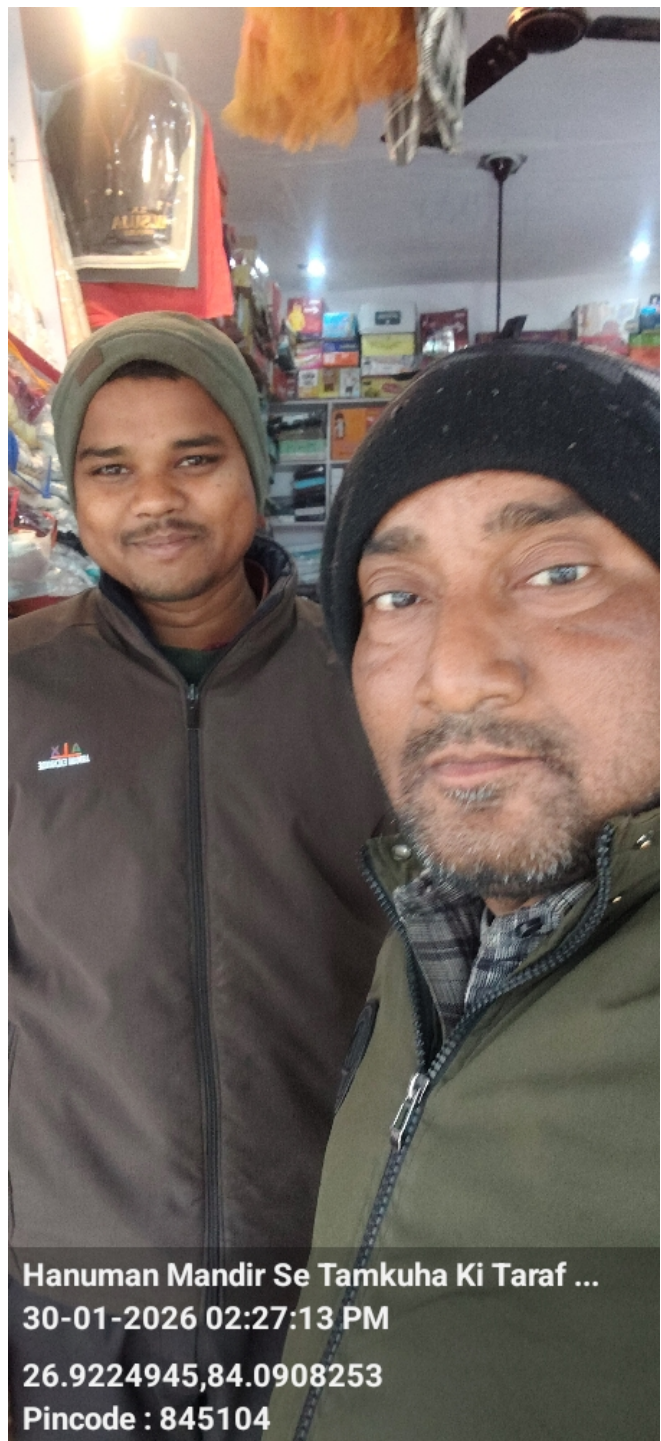
Photo with Agent