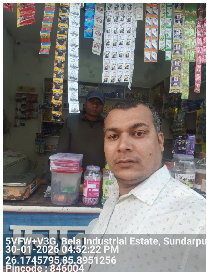
Photo with Agent