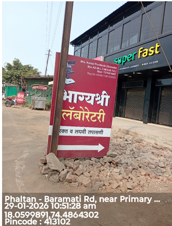
Phaltan - Baramati Rd, near Primary ... 29-01-2026 10:51:28 am 18.0599891,74.4864302 Pincode : 413102

Take Photo of QR Code/Soundbox/EDC Machine