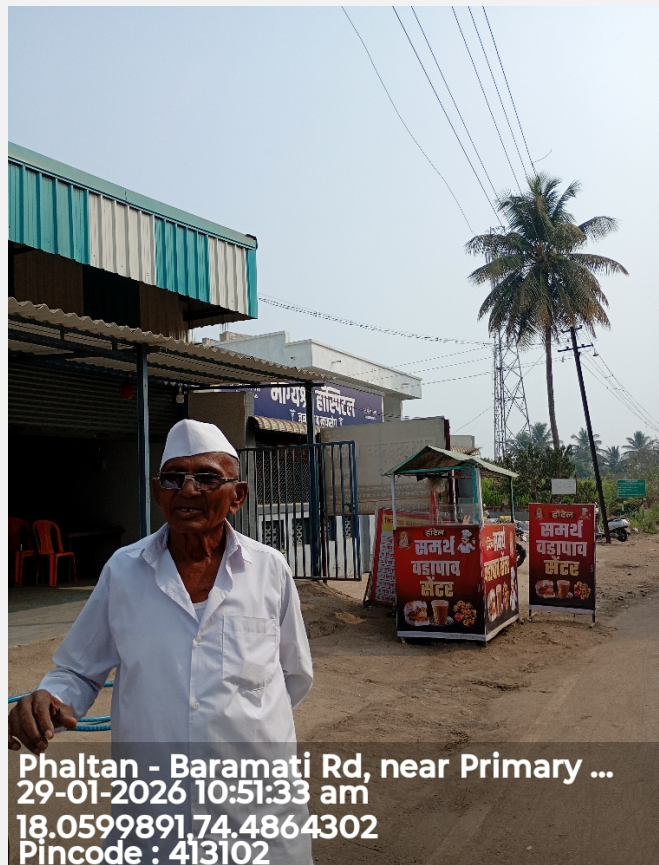
Phaltan - Baramati Rd, near Primary ... 29-01-2026 10:51:33 am 18.0599891,74.4864302 Pincode : 413102

Shop front with horizontal view covering the left & right of the shop establishing if the shop is an individual structure, in a marketplace, highway, isolated place, in a cluster framework.