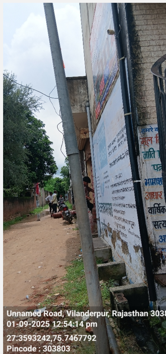
Unnamed Road, Vilanderpur, Rajasthan 303 01-09-2025 12:54:14 pm 27.3593242,75.7467792 Pincode : 303803

20 residence_photo_with_inside_household