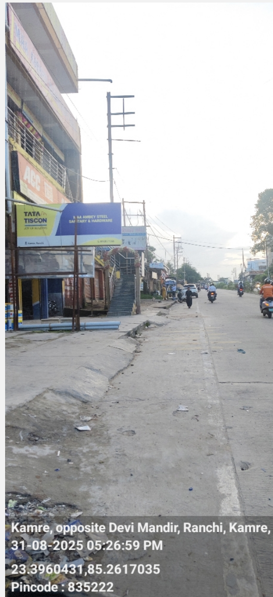
Kamre, opposite Devi Mandir, Ranchi, Kamre, 31-08-2025 05:26:59 PM 23.3960431,85.2617035 Pincode : 835222