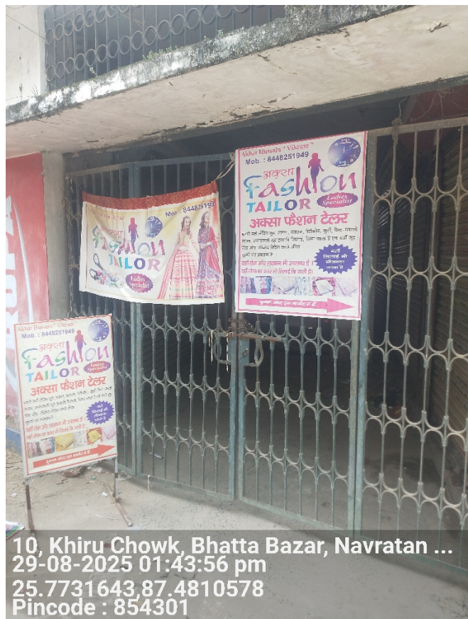
Photo with UPI Scanner