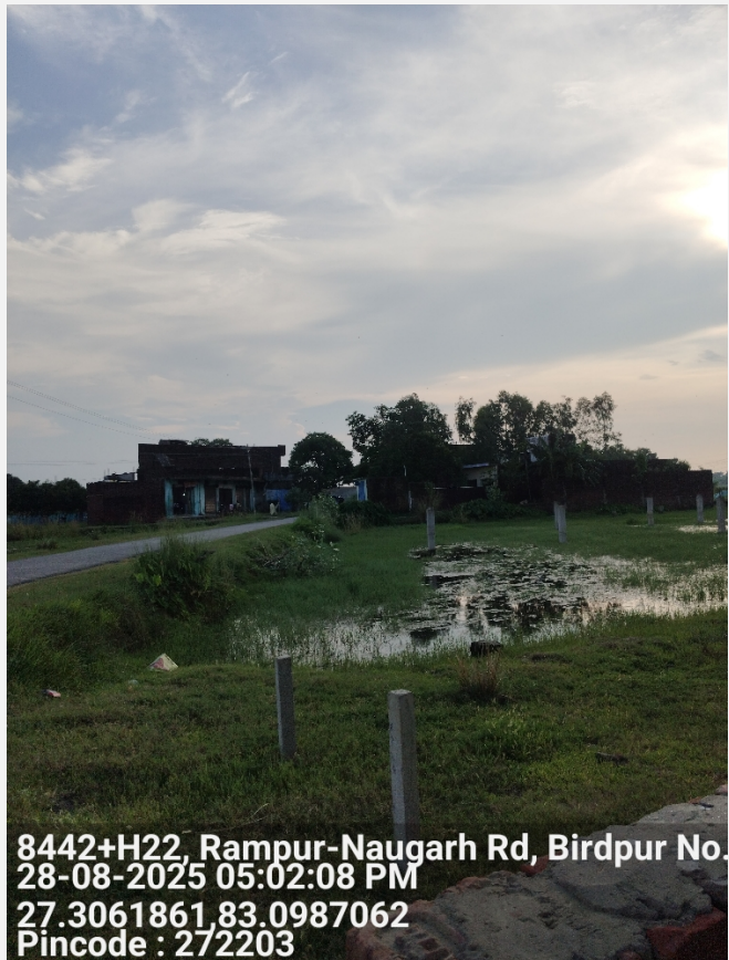
Photo of Stock