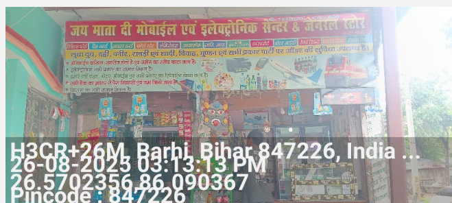
Shop Photo Outside