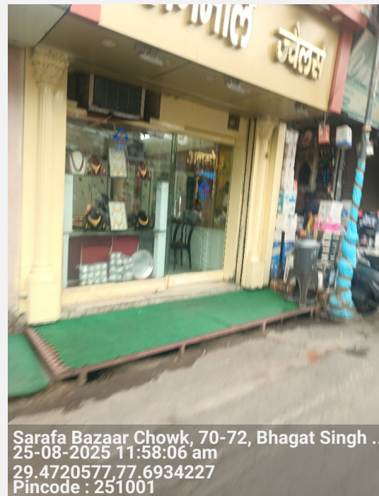
Sarafa Bazaar Chowk, 70-72, Bhagat Singh . 25-08-2025 11:58:06 am 29.4720577,77.6934227 Pincode : 251001