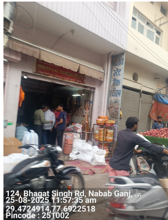
124, Bhagat Singh Rd, Nabab Ganj, ... 25-08-2025 11:57:35 am 29.4724914,77.6922518 Pincode : 251002