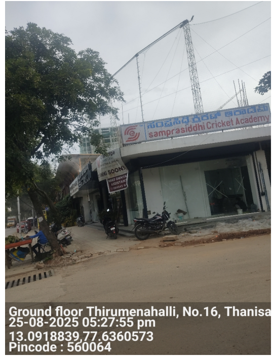
Ground floor Thirumenahalli, No.16, Thanisa 25-08-2025 05:27:55 pm 13.0918839,77.6360573 Pincode : 560064