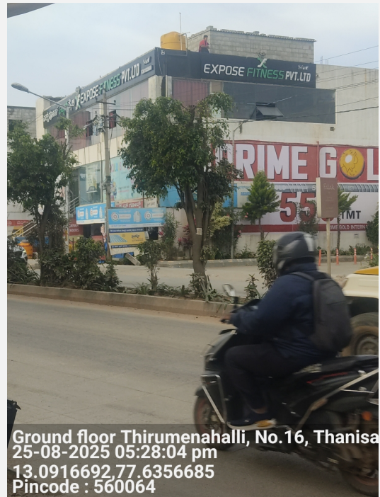
Ground floor Thirumenahalli, No.16, Thanisa 25-08-2025 05:28:04 pm 13.0916692,77.6356685 Pincode : 560064