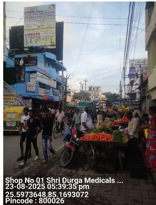
Shop No 01 Shri Durga Medicals ... 23-08-2025 05:39:35 pm 25.5973648,85.1693072 Pincode : 800026