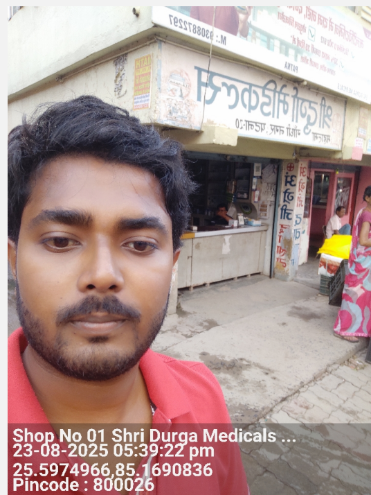
Shop No 01 Shri Durga Medicals ... 23-08-2025 05:39:22 pm 25.5974966,85.1690836 Pincode : 800026