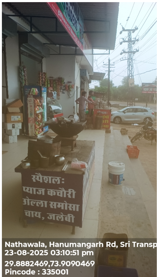
Nathawala, Hanumangarh Rd, Sri Transp 23-08-2025 03:10:51 pm 29.8882469,73.9090469 Pincode : 335001

Shop front with horizontal view covering the left & right of the shop establishing if the shop is an individual structure, in a marketplace, highway, isolated place, in a cluster framework.