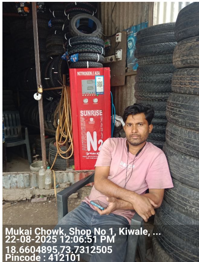
Mukai Chowk, Shop No 1, Kiwale, ... 22-08-2025 12:06:51 PM 18.6604895,73.7312505 Pincode : 412101

Take Photo of Person Met Inside the Shop