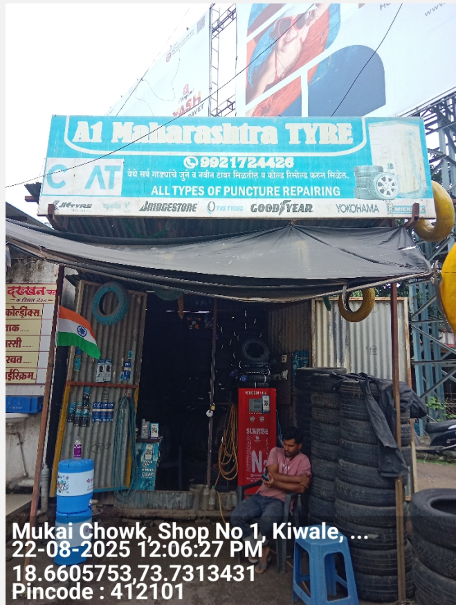
Mukai Chowk, Shop No 1, Kiwale, ... 22-08-2025 12:06:27 PM 18.6605753,73.7313431 Pincode : 412101

Shop front photo with full vertical viewpoint i.e; shop board, sealing, entrance, ground on which the shop is established (cemented, pilers, bricks, stands, mud, wheels etc.)