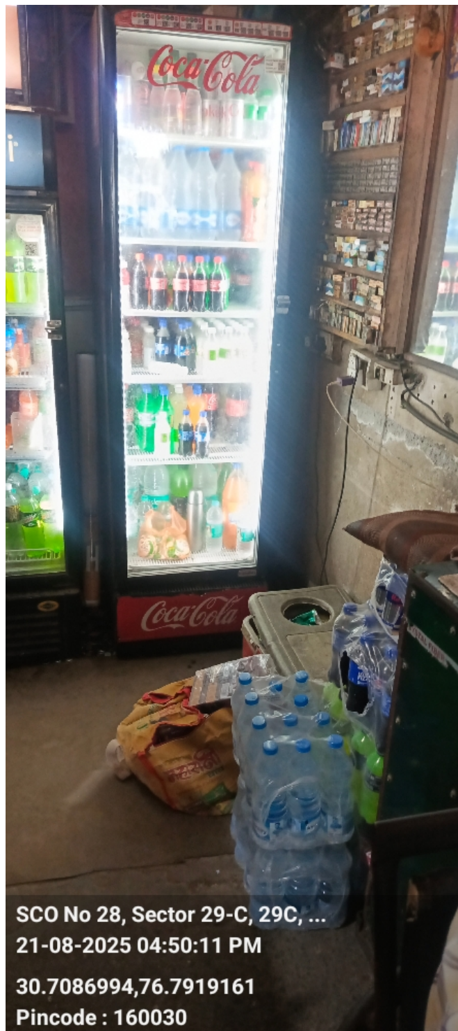
Photo of Machinery Setup