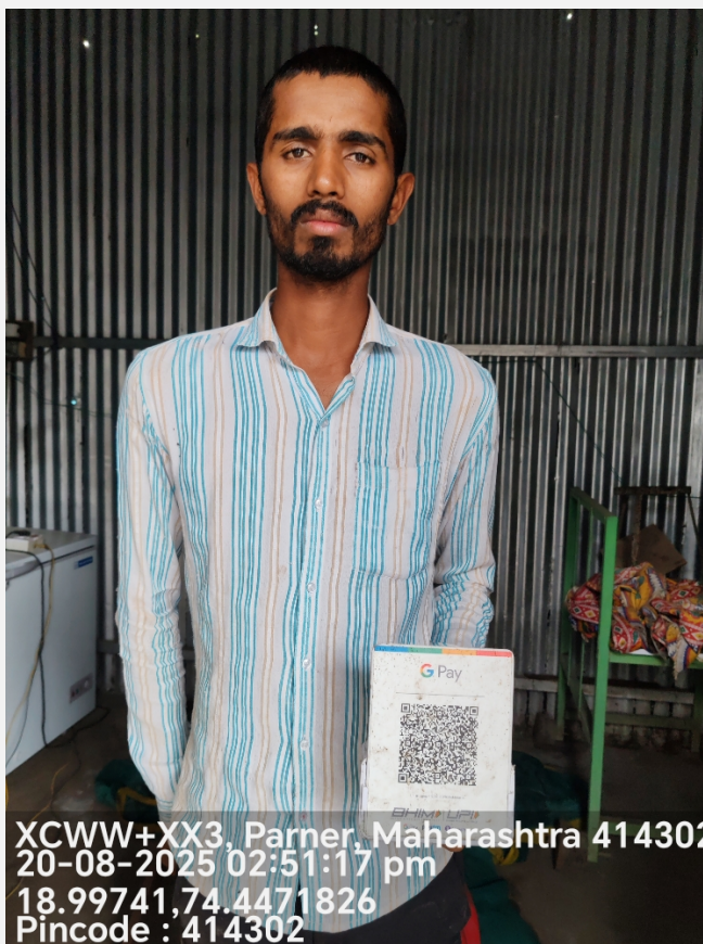
Photo with UPI Scanner