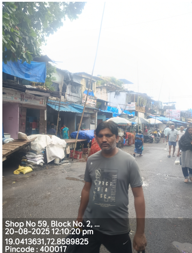
Shop No 59, Block No. 2, ... 20-08-2025 12:10:20 pm 19.0413631,72.8589825 Pincode : 400017

Shop inside with inventory photos establishing that the inside is of the same shop where the front photo was taken