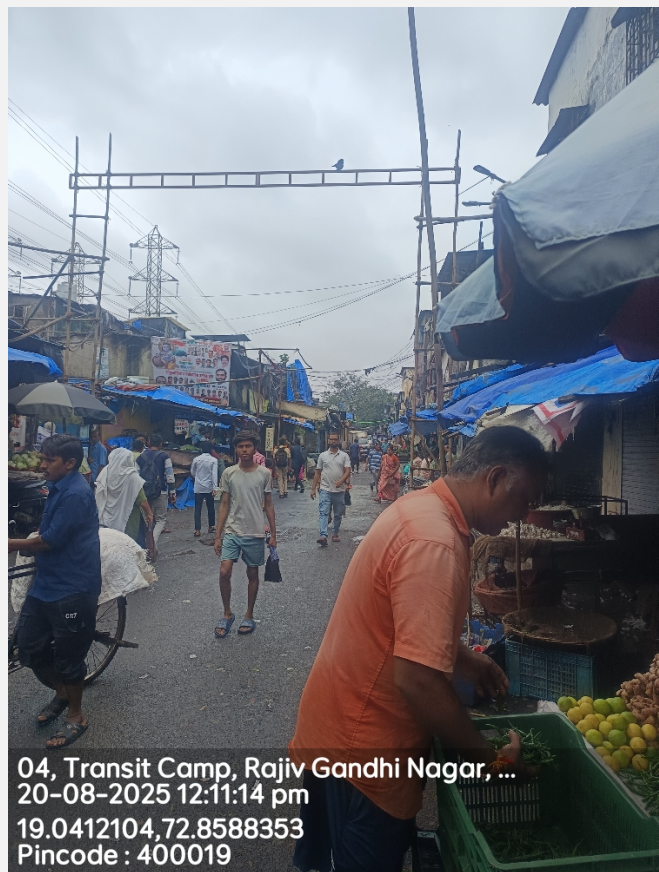
04, Transit Camp, Rajiv Gandhi Nagar, ... 20-08-2025 12:11:14 pm 19.0412104,72.8588353 Pincode : 400019

Shop front with horizontal view covering the left & right of the shop establishing if the shop is an individual structure, in a marketplace, highway, isolated place, in a cluster framework.