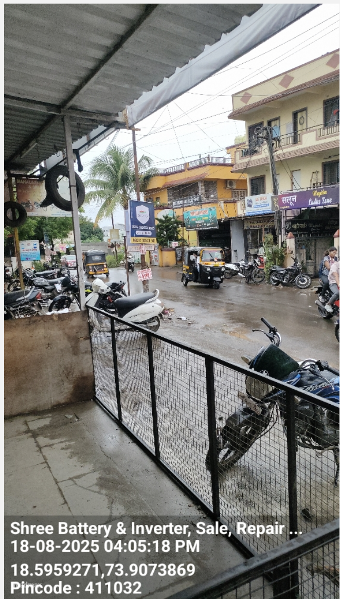
Shree Battery & Inverter, Sale, Repair ... 18-08-2025 04:05:18 PM 18.5959271,73.9073869 Pincode : 411032

Take Photo of Person Met Inside the Shop