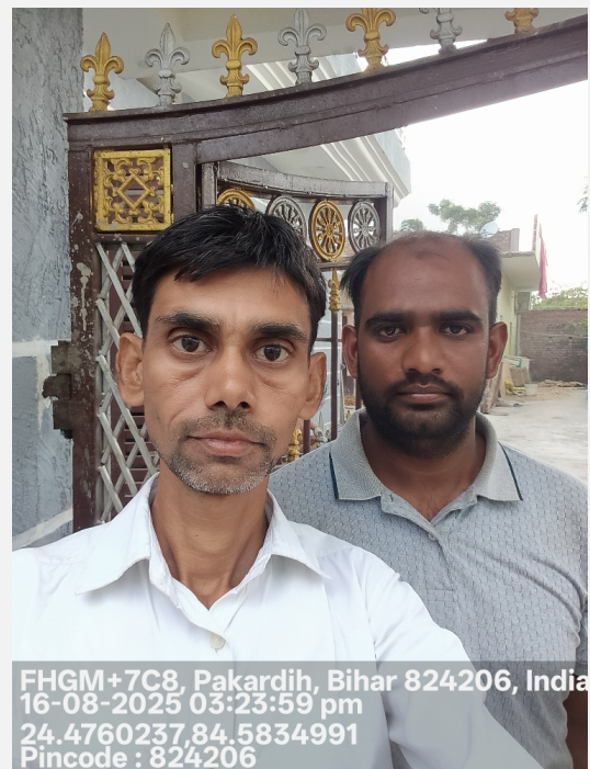
Photo with Agent