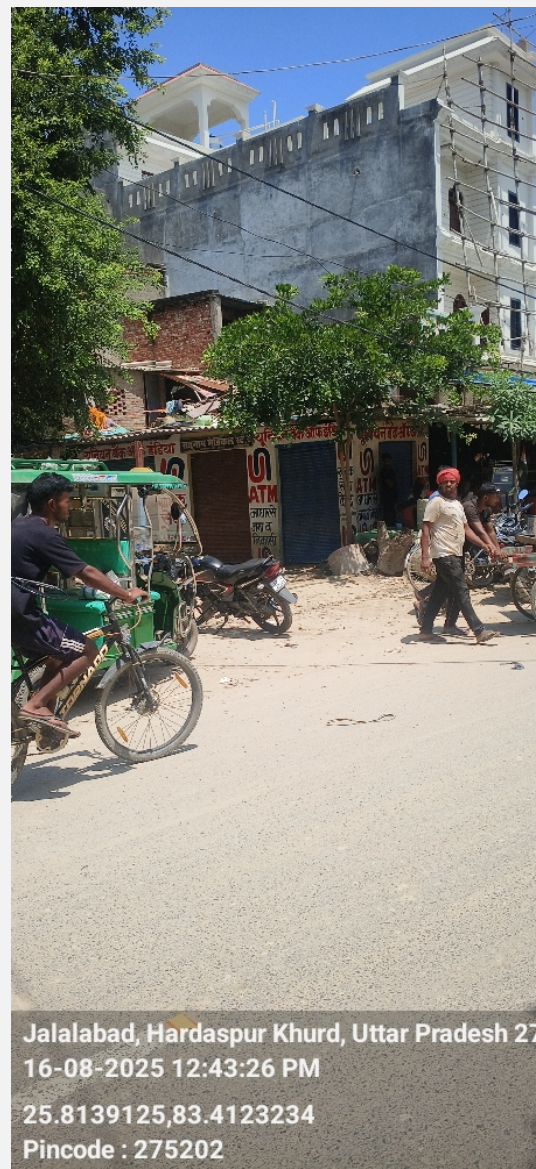
Jalalabad, Hardaspur Khurd, Uttar Pradesh 27 16-08-2025 12:43:26 PM 25.8139125,83.4123234 Pincode : 275202

23 residence_photo_with_inside_household