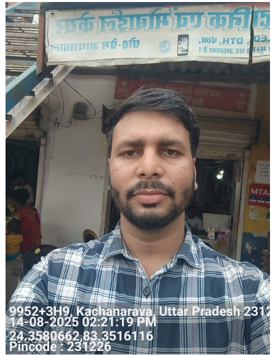
Photo with Agent

9952+3H9, Kachanarava, Uttar Pradesh 2312 14-08-2025 02:21:19 PM 24.3580662,83.3516116 Pincode : 231226