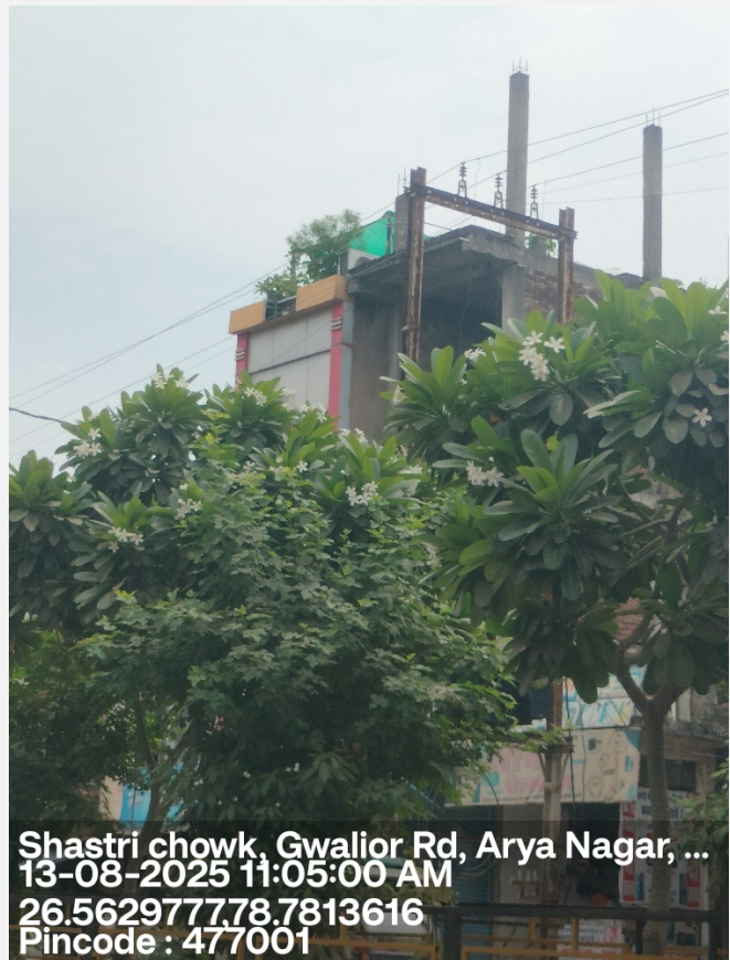
Shastri chowk, Gwalior Rd, Arya Nagar, ... 13-08-2025 11:05:00 AM 26.56297778.7813616 Pincode : 477001

Shop front with horizontal view covering the left & right of the shop establishing if the shop is an individual structure, in a marketplace, highway, isolated place, in a cluster framework.