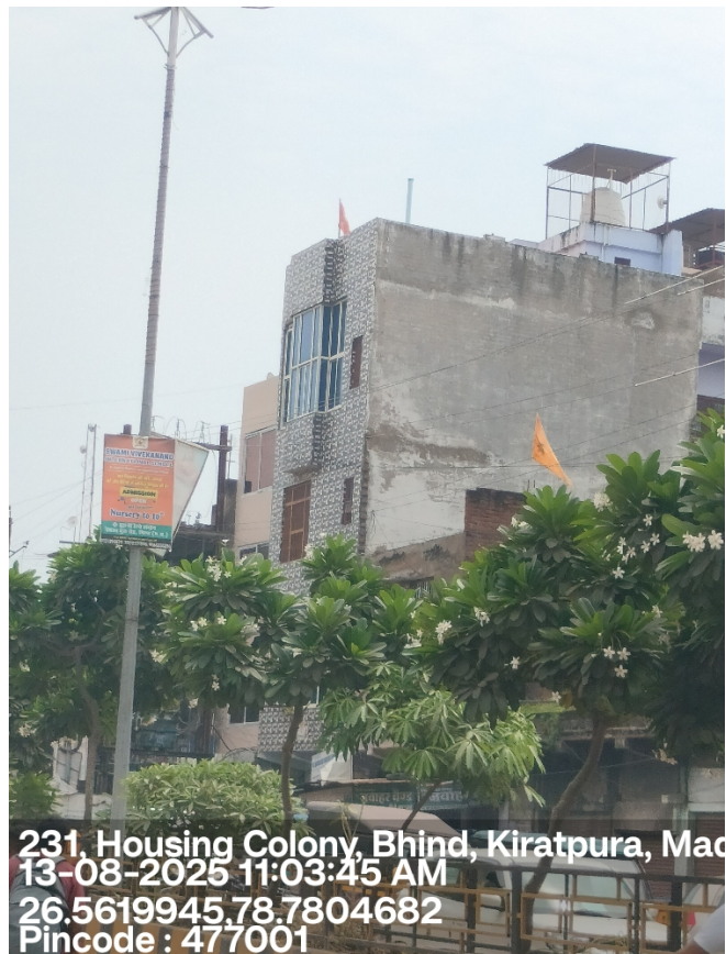
231, Housing Colony, Bhind, Kiratpura, Madhya Pradesh 13-08-2025 11:03:45 AM 26.5619945.78.7804682 Pincode : 477001

Shop inside with inventory photos establishing that the inside is of the same shop where the front photo was taken