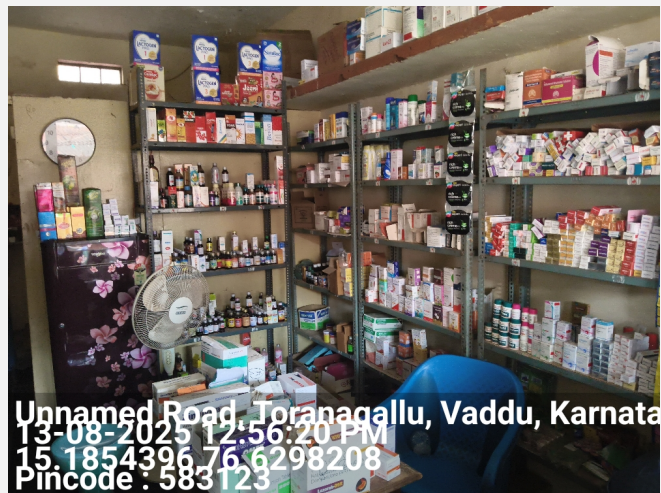
Unnamed Road, Toranagallu, Vaddu, Karnataka 13-08-2025 12:56:20 PM 15.1854396, 76.6298208 Pincode : 583123

Shop inside with inventory photos establishing that the inside is of the same shop where the front photo was taken