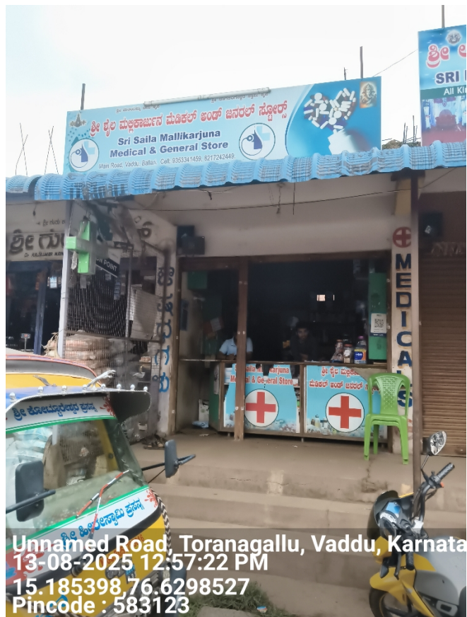
Unnamed Road, Toranagallu, Vaddu, Karnataka 13-08-2025 12:57:22 PM 15.185398, 76.6298527 Pincode : 583123

Shop front with horizontal view covering the left & right of the shop establishing if the shop is an individual structure, in a marketplace, highway, isolated place, in a cluster framework.