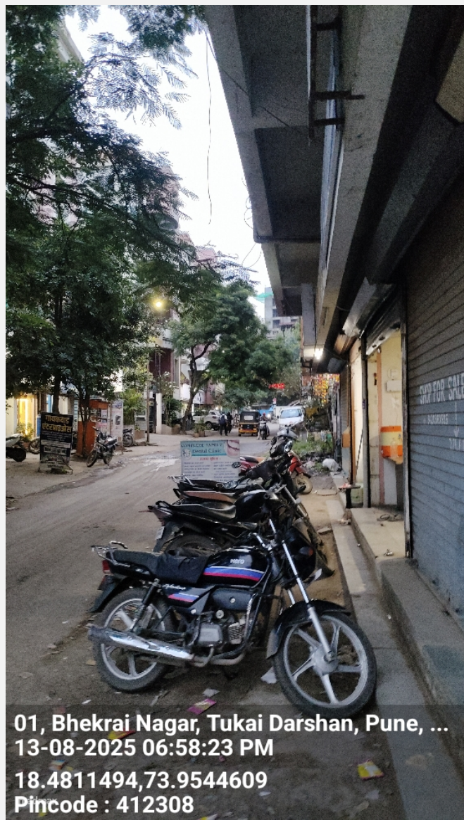
01, Bhekrai Nagar, Tukai Darshan, Pune, ... 13-08-2025 06:58:23 PM 18.4811494,73.9544609 Pincode : 412308

Shop front with horizontal view covering the left & right of the shop establishing if the shop is an individual structure, in a marketplace, highway, isolated place, in a cluster framework.