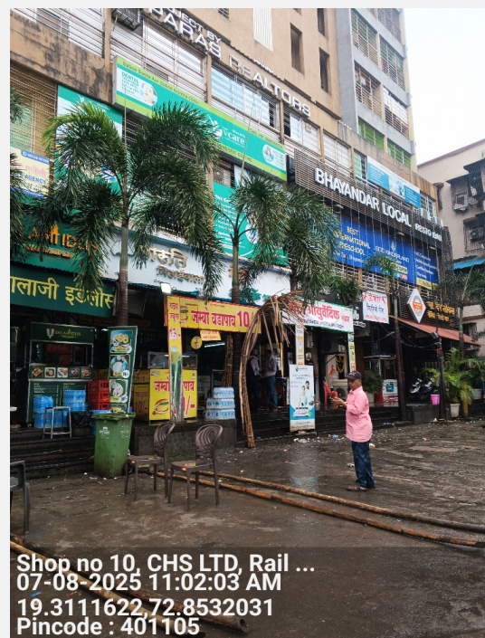
Shop no 10, CHS LTD, Rail ... 07-08-2025 11:02:03 AM 19.3111622,72.8532031 Pincode : 401105