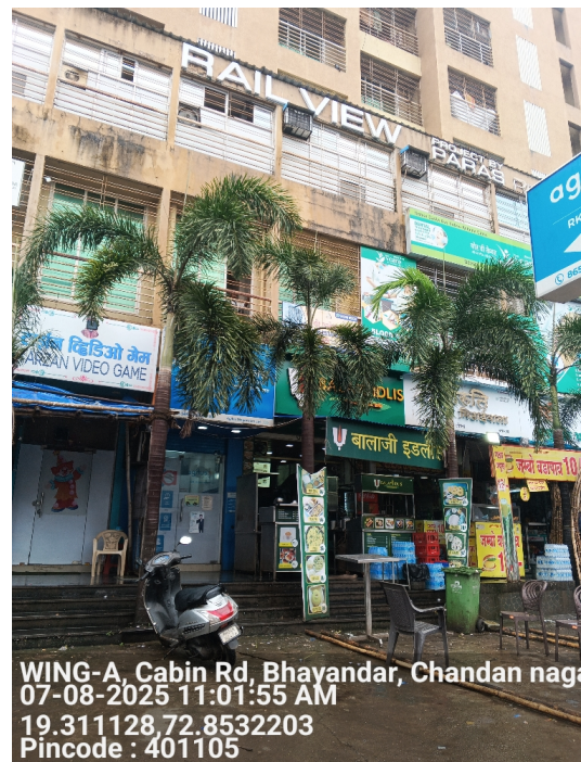
WING-A, Cabin Rd, Bhayandar, Chandan nag 07-08-2025 11:01:55 AM 19.311128,72.8532203 Pincode : 401105