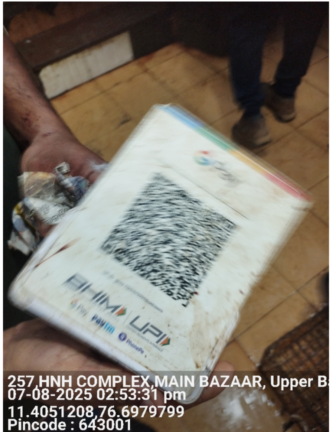
Photo with UPI Scanner