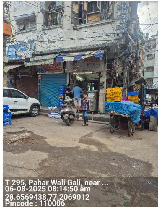
T 295, Pahar Wali Gali, near ... 06-08-2025 08:14:50 am 28.6569438,77.2069012 Pincode : 110006