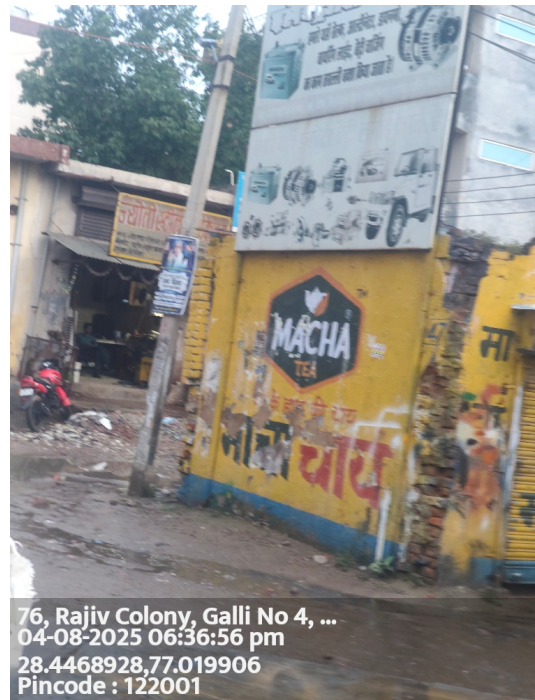
76, Rajiv Colony, Galli No 4, ... 04-08-2025 06:36:56 pm 28.4468928,77.019906 Pincode : 122001