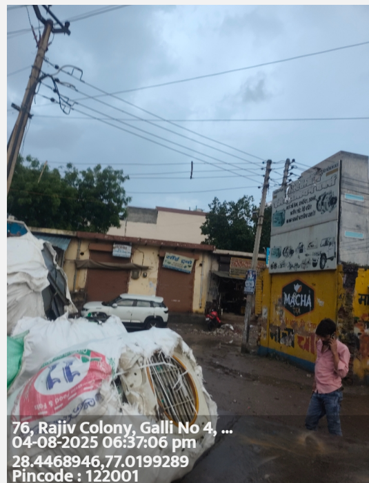
76, Rajiv Colony, Galli No 4, ... 04-08-2025 06:37:06 pm 28.4468946,77.0199289 Pincode : 122001