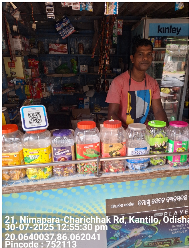
21, Nimapara-Charichhak Rd, Kantilo, Odisha 30-07-2025 12:55:30 pm 20.0640037,86.062041 Pincode : 752113

Shop inside with inventory photos establishing that the inside is of the same shop where the front photo was taken