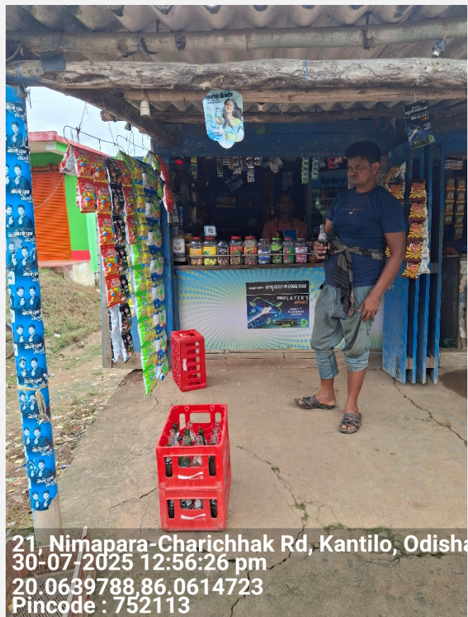
21, Nimapara-Charichhak Rd, Kantilo, Odisha 30-07-2025 12:56:26 pm 20.0639788,86.0614723 Pincode : 752113

Shop front with horizontal view covering the left & right of the shop establishing if the shop is an individual structure, in a marketplace, highway, isolated place, in a cluster framework.