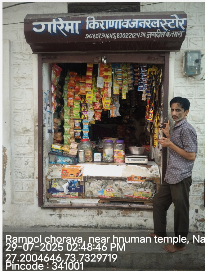
Rampol choraya, near hnuman temple, Na 29-07-2025 02:48:46 PM 27.2004646,73.7329719 Pincode : 341001

Shop front photo with full vertical viewpoint i.e; shop board, sealing, entrance, ground on which the shop is established (cemented, pilers, bricks, stands, mud, wheels etc.)