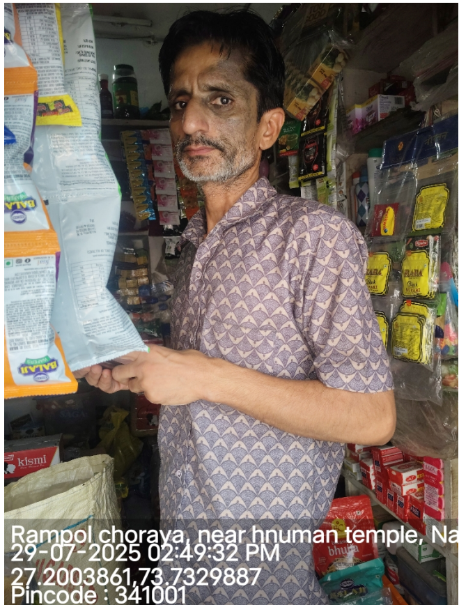
Rampol choraya, near hnuman temple, Na 29-07-2025 02:49:32 PM 27.2003861,73.7329887 Pincode : 341001

Take Photo of Person Met Inside the Shop