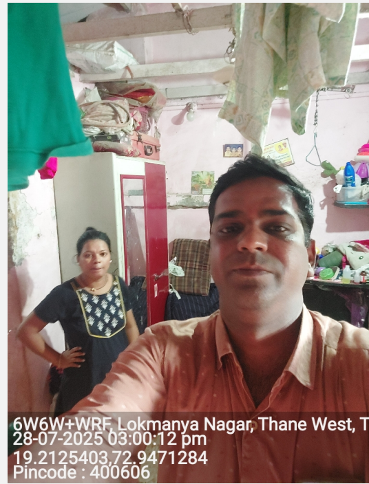
Photo with Agent