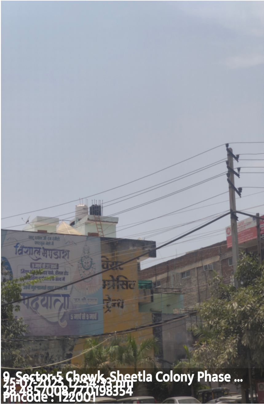
9 Sector 5 Chowk, Sheetla Colony Phase ... 25-07-2025 12:54:33 pm 78 4857008 77 0198354 Pincode : 122001