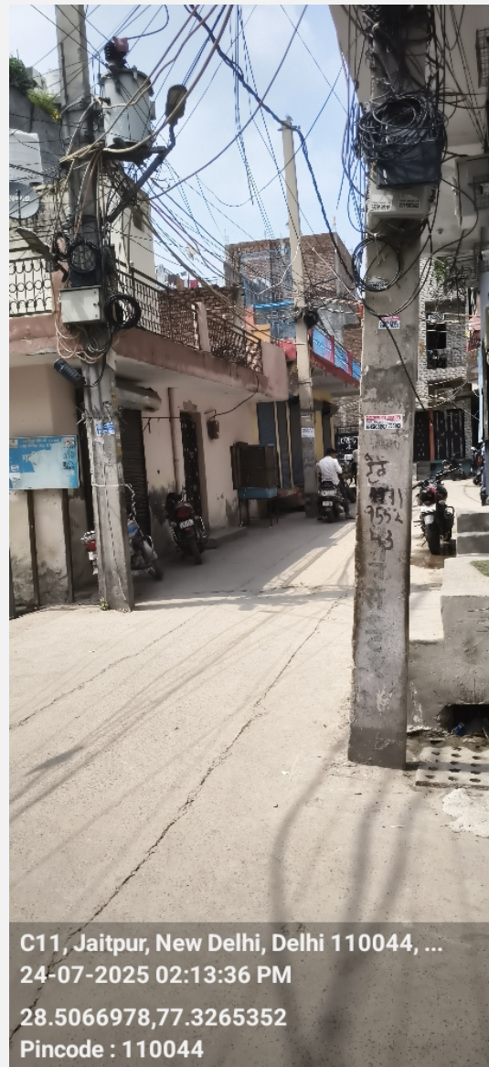
C11, Jaitpur, New Delhi, Delhi 110044, ... 24-07-2025 02:13:36 PM 28.5066978,77.3265352 Pincode : 110044