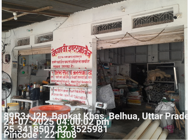
Shop Photo Outside