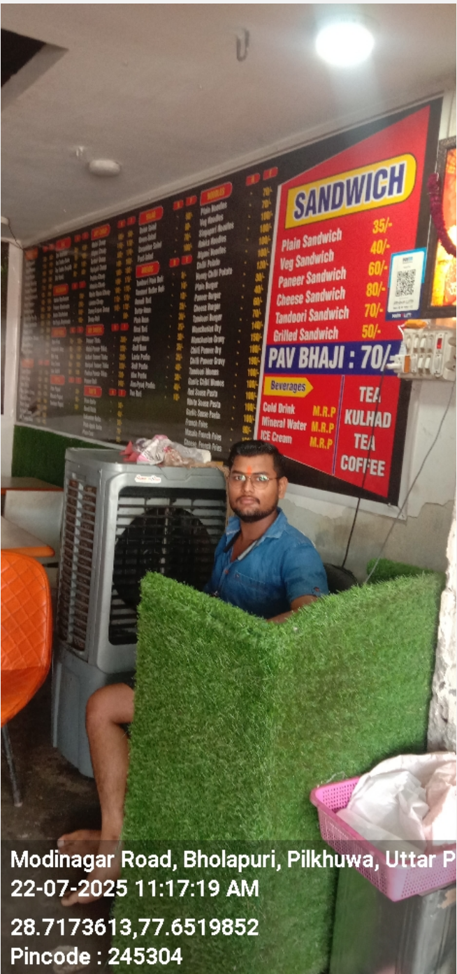
Modinagar Road, Bholapuri, Pilkhuwa, Uttar P 22-07-2025 11:17:19 AM 28.7173613,77.6519852 Pincode : 245304

Take Photo of Person Met Inside the Shop