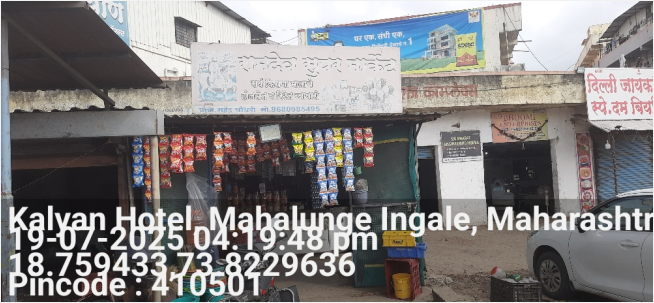
Shopto Photo Outside