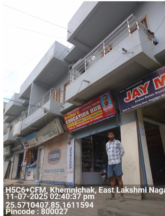
H5C6+CFM, Khemnichak, East Lakshmi Naga 11-07-2025 02:40:37 pm 25.5710407,85.1611594 Pincode : 800027