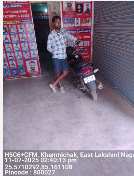
H5C6+CFM, Khemnichak, East Lakshmi Naga 11-07-2025 02:40:13 pm 25.5710292,85.161108 Pincode : 800027