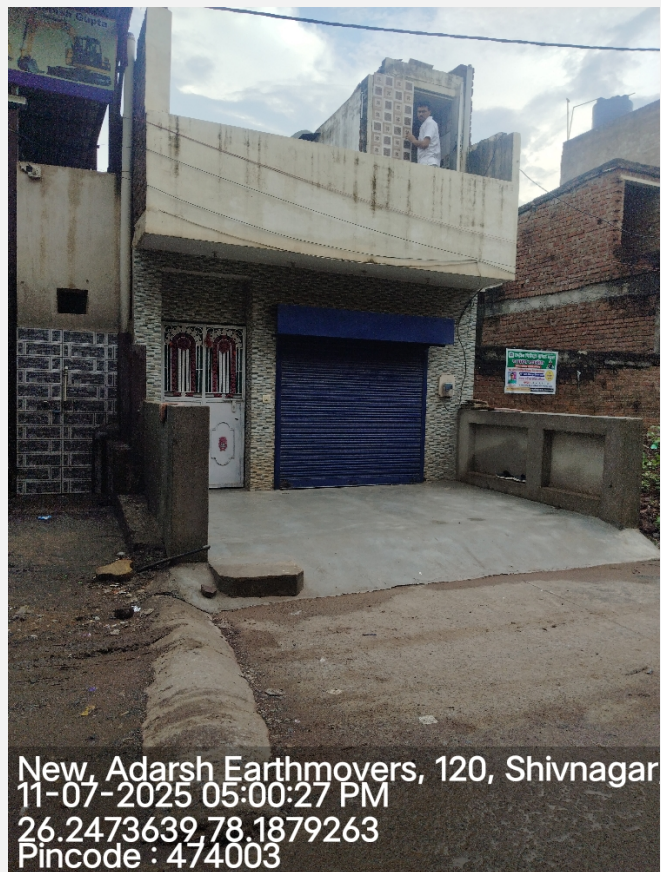
New, Adarsh Earthmovers, 120, Shivnagar 11-07-2025 05:00:27 PM 26.2473639, 78.1879263 Pincode : 474003

Shop front with horizontal view covering the left & right of the shop establishing if the shop is an individual structure, in a marketplace, highway, isolated place, in a cluster framework.