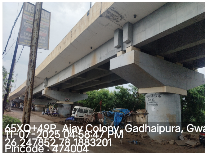
65X0+49P, Ajay Colony, Gadhaipura, Gwalior 11-07-2025 04:58:47 PM 26.247852, 78.1883201 Pincode : 474004

Shop inside with inventory photos establishing that the inside is of the same shop where the front photo was taken