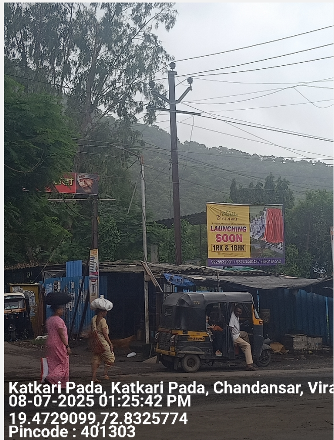
Katkari Pada, Katkari Pada, Chandansar, Virar 08-07-2025 01:25:42 PM 19.4729099,72.8325774 Pincode : 401303

Shop front with horizontal view covering the left & right of the shop establishing if the shop is an individual structure, in a marketplace, highway, isolated place, in a cluster framework.