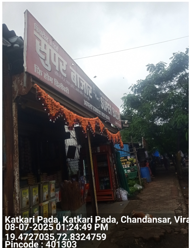
Katkari Pada, Katkari Pada, Chandansar, Virar 08-07-2025 01:24:49 PM 19.4727035,72.8324759 Pincode : 401303

Shop inside with inventory photos establishing that the inside is of the same shop where the front photo was taken