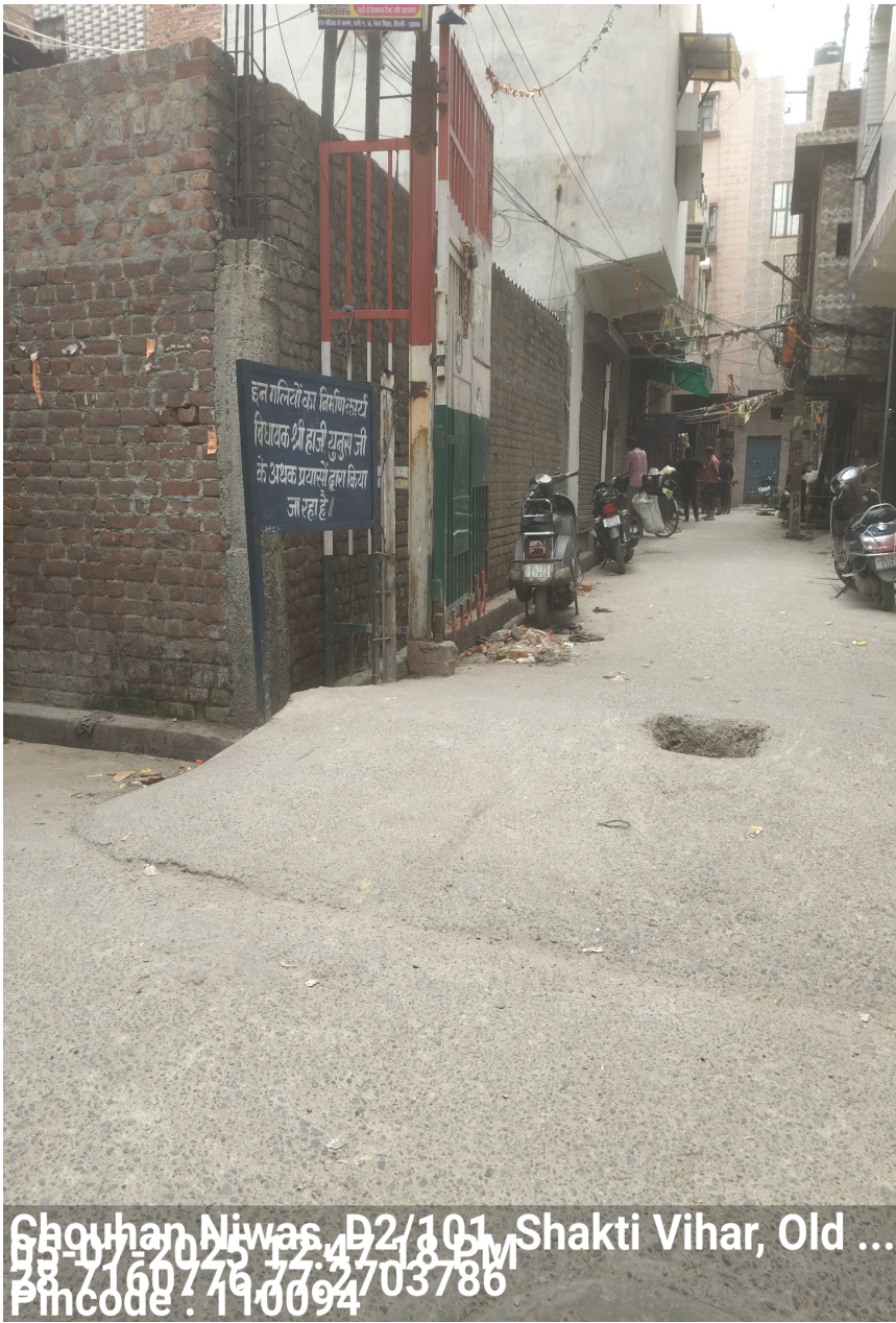
Ghoushan Niwas, D2/101, Shakti Vihar, Old ... Pincode : 110094