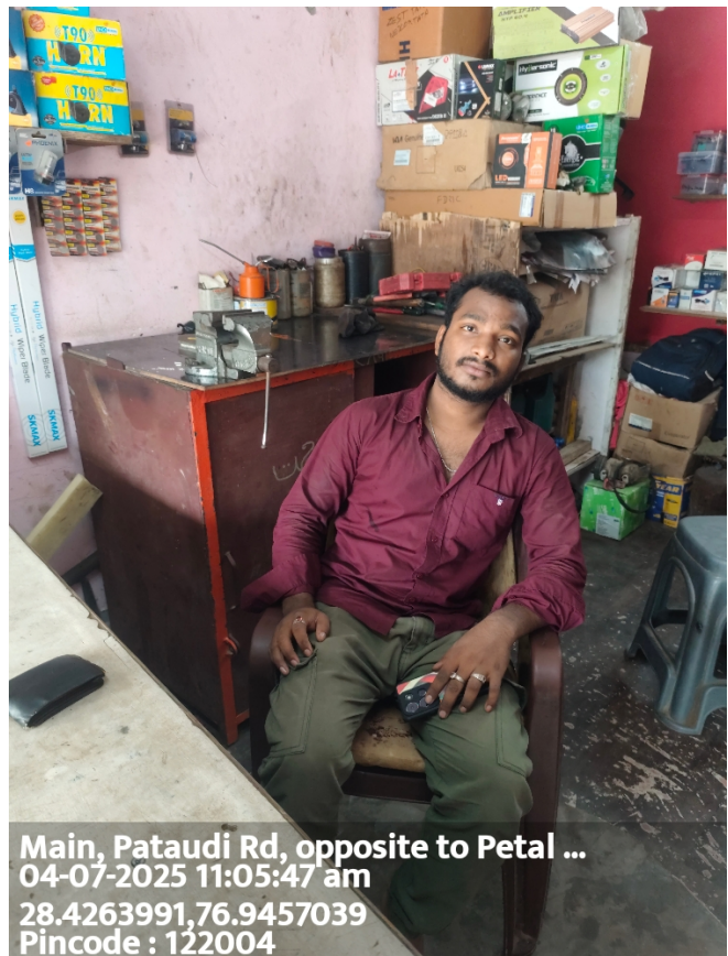
Main, Pataudi Rd, opposite to Petal ... 04-07-2025 11:05:47 am 28.4263991,76.9457039 Pincode : 122004

Take Photo of Person Met Inside the Shop