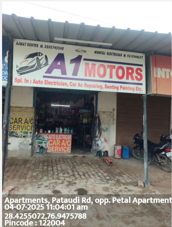
Apartments, Pataudi Rd, opp. Petal Apartment 04-07-2025 11:04:01 am 28.4255072,76.9475788 Pincode : 122004

Shop front photo with full vertical viewpoint i.e; shop board, sealing, entrance, ground on which the shop is established (cemented, pilers, bricks, stands, mud, wheels etc.)