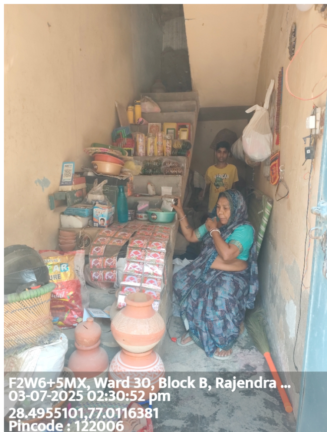
F2W6+5MX, Ward 30, Block B, Rajendra ... 03-07-2025 02:30:52 pm 28.4955101,77.0116381 Pincode : 122006

Shop inside with inventory photos establishing that the inside is of the same shop where the front photo was taken