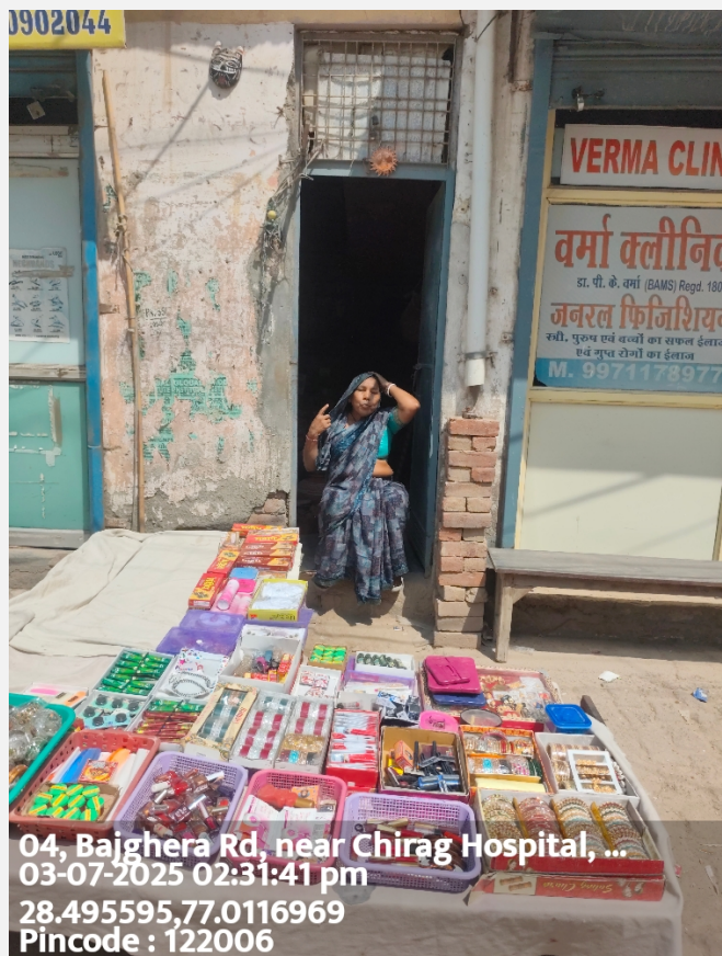
04, Bajghera Rd, near Chirag Hospital, ... 03-07-2025 02:31:41 pm 28.495595,77.0116969 Pincode : 122006

Shop front with horizontal view covering the left & right of the shop establishing if the shop is an individual structure, in a marketplace, highway, isolated place, in a cluster framework.